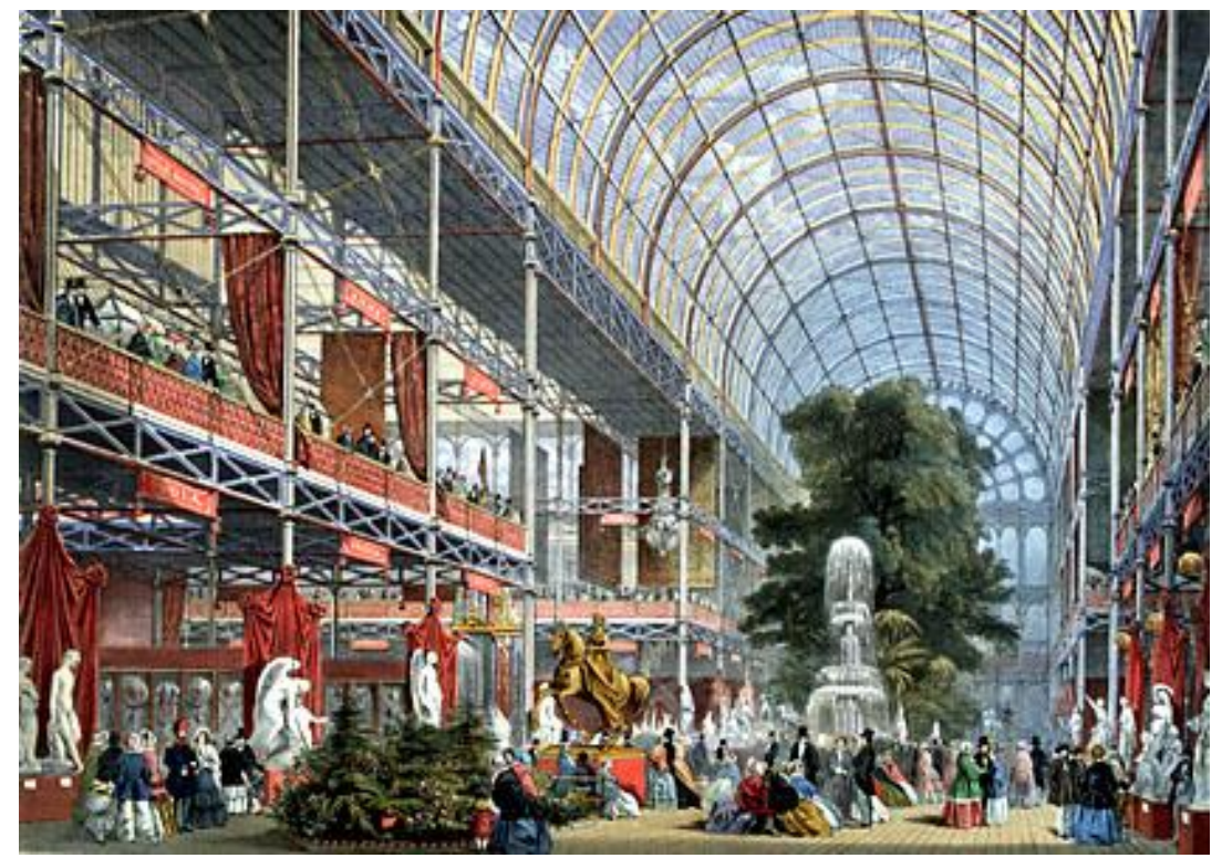
The Crystal Palace, Hyde Park, London, 1851. The Crystal Palace was built to hold the Great Exhibition of 1851.